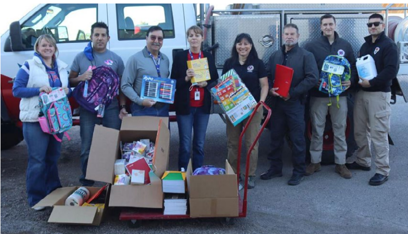
The Albuquerque chapter of the FBI Citizens Academy Alumni Association recently made a generous donation of school supplies, backpacks, and other items for students to the local school district.

Since its founding in 2005, the national organization — led by an all-volunteer board of directors — has built both the governance and operating infrastructure to support its nearly 60 Chapters. In the past two years alone, the organization has developed and implemented dozens of new and updated policies, procedures, training programs, and other resources. The organization also invested in technology to create virtual platforms that connect and engage members so innovative ideas and best practices could be shared among chapters.