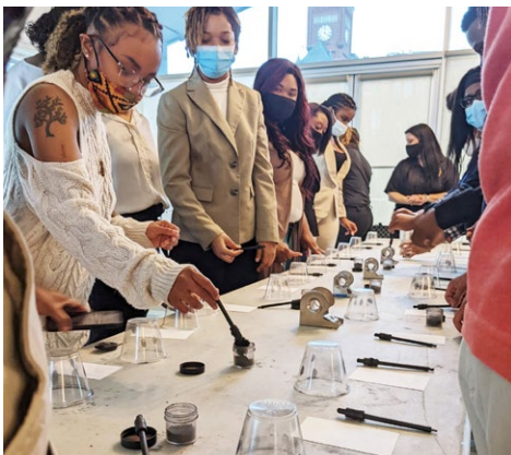
FBI Charlotte partnered with Johnson C. Smith University to share information about Bureau careers and provide hands-on activities for students during the recent Collegiate Academy.