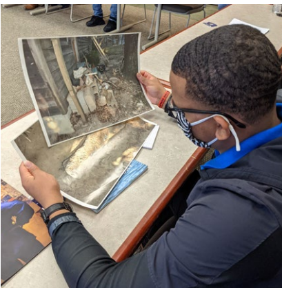
Fifteen students from Philander Smith College participated in the Collegiate Academy hosted by FBI Little Rock.

The Little Rock Division partnered with Arkansas Baptist College, Philander Smith College, and University of Arkansas at Pine Bluff to host on-campus Collegiate Academies. FBI employees hosted sessions on cyber-safety, forensic accounting, civil rights, employment, and COVID-19 fraud schemes.